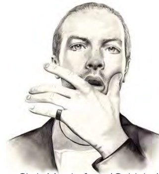
Chris Martin from 'Coldplay'